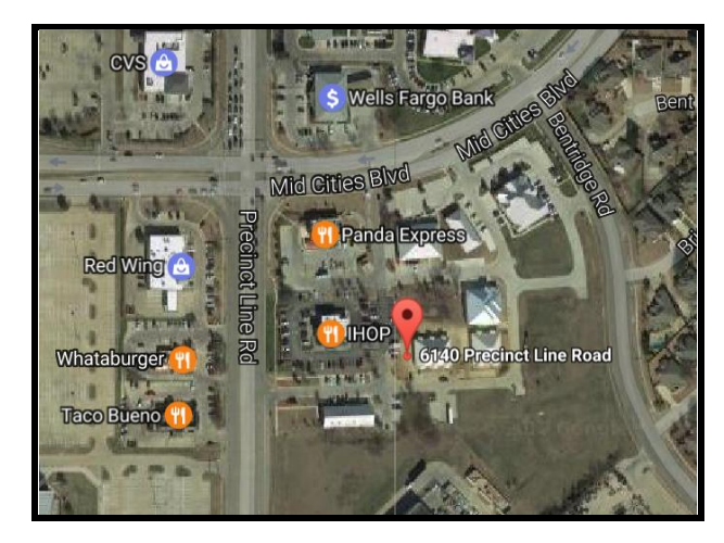
This information is believed to be accurate, but no representation or warranty, express or implied, as to its accuracy or completeness is made by any party. The presentation of this property is submitted subject to errors, omissions, change of price or prior sale or lease or withdrawal without notice.